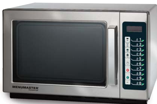
Model RCS511TS shown